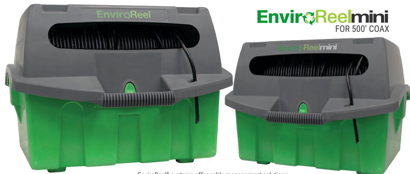
EnviroReel® systems offer cable management solutions to accommodate 1000 or 500 feet of coaxial cable

The EnviroReel system accommodates multiple types of cable & wire including coaxial, mini-coaxial, Category 5 & Category 6, fiber, telephone, speaker & security varieties – and up to 1,000 feet of Series 6 coax.